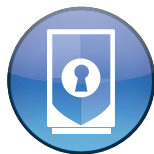
KeyOS MultiPack Utility