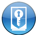
KeyOS MultiKey Server